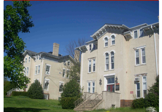
The "Delta" and "Omega" houses, as seen from Seminary Place.